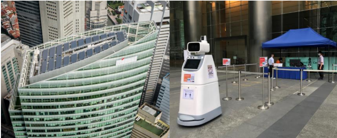
Ocean Financial Centre (pictured):

Robust IT infrastructure and smart building technology to support tenant requirements, enhance workplace safety and optimise energy consumption